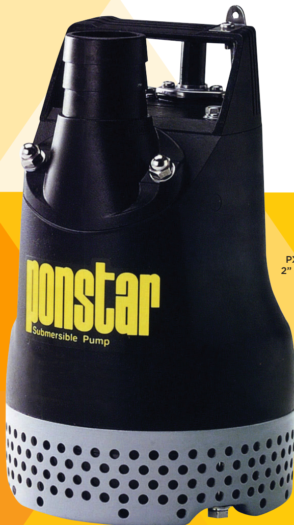
PX55022 2" (50mm)

New generation compact submersible electric pump. Versatile, compact and powerful - this pump is built tough and suitable for both construction and hire applications.