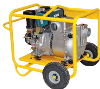
FULL TRASH PUMPS