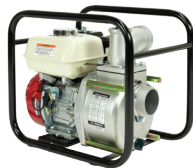
SEMI TRASH PUMPS